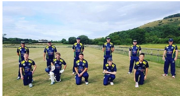
Poynings Cricket Club

Despite the challenging summer faced by us all, it was still a successful summer for Poynings Cricket Club on and off the field. The 2020 season was cut short due to COVID, with the season unable to start until August, but we still managed to complete 15 games by mid-September. Poynings entered organised competitions run by Sussex Cricket in form of the 1st Central August Cup and the Sussex Slam, a newly formed midweek t20 competition where we re-branded as 'Dynamo Poynings'. With results not particularly important it allowed us to give plenty of playing opportunities to our members as well as to new recruits that joined the club during the summer. Over 40 players were used across the 15 games that we played with plenty of positive performances from everyone, especially our younger players, who continue to make excellent progress and are now an integral part of our club moving forward.